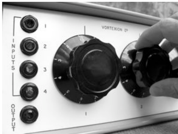
Fig. 2. Vortexion mixer.

instrument). The Vortexion 4/15/M (four balanced inputs, one unbalanced output) uses EF86 valves at both input and output stages. These valves are notoriously noisy. However, the latent noise of the device generated by the valves is the feedback's paradise. The four large Bakelite knobs of the Vortexion mixer also make an excellent interface for controlling the feedback (Fig. 2). The use of the Mackie mixing desk as a matrix supports the idea of appropriation of hardware over the construction of specially made devices. To build a portable matrix with as many options would have involved significant 'build-time', and I thought that this build-time was best spent on developing other aspects of the system. The controller-objects are found objects that have been exploited in a number of ways to output variable resistances. These resistances are then used, via a resistance matrix, to control the feedback [1]. The resistance matrix is a passive junction box with audio inputs and outputs and patch sockets for the controller-objects.