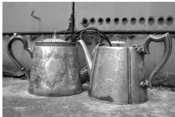
Fig. 4. Victorian teapots.

would create a very strong visual and have a significant impact rhetorically. They were not just any old teapots, they were antiques, objects of desire that told a story, which was far more important than their use to evoke nostalgia. I thought these objects, when incorporated into the Kreeback instrument, had the potential to win over an audience before any sound was made (Fig. 4).